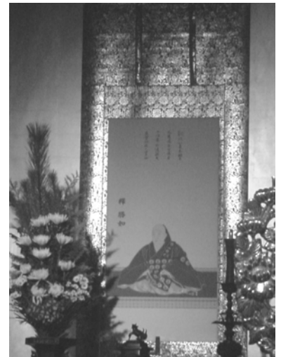
Naijin at Hongwanji, Kyoto, Japan

What is the "gejin" ( gay-jean )? The "gejin" is the seating area where the members sit.