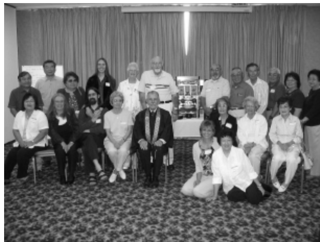
MEMBERS OF SPOKANE & MOSES LAKE SANGHA'S