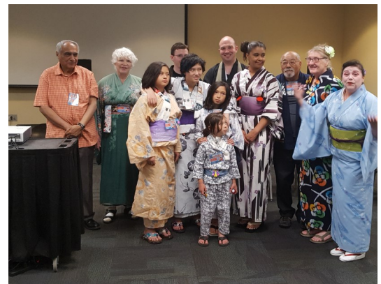
Photo from 2018 Kuronekocon

Tickets are available at www.Kuronekocon.com