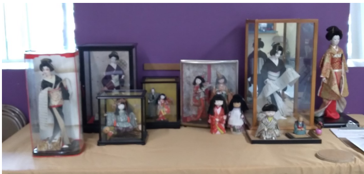
Japanese hand-made dolls, Japanese scrolls, prints, dishes and more for Sale!